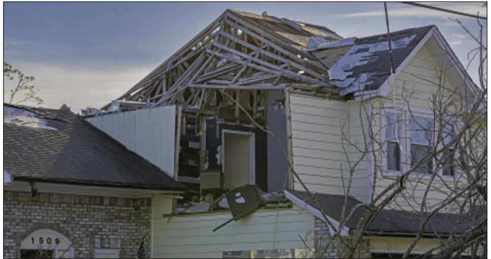
Windstorms can cause extensive damage to your property. It's best to be prepared.

Keep current on possible inclement weather conditions. If you're one