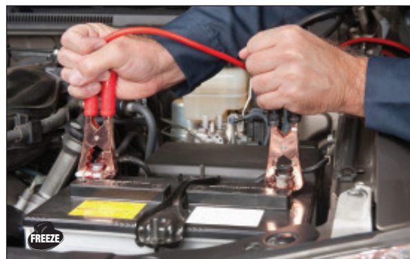
Place red clamp on positive post, black on negative.

If you're one of the few who still enjoy shifting gears, the jump-starter is also a good bet. Just make sure you put the transmission in neutral and apply the emergency brake before at-